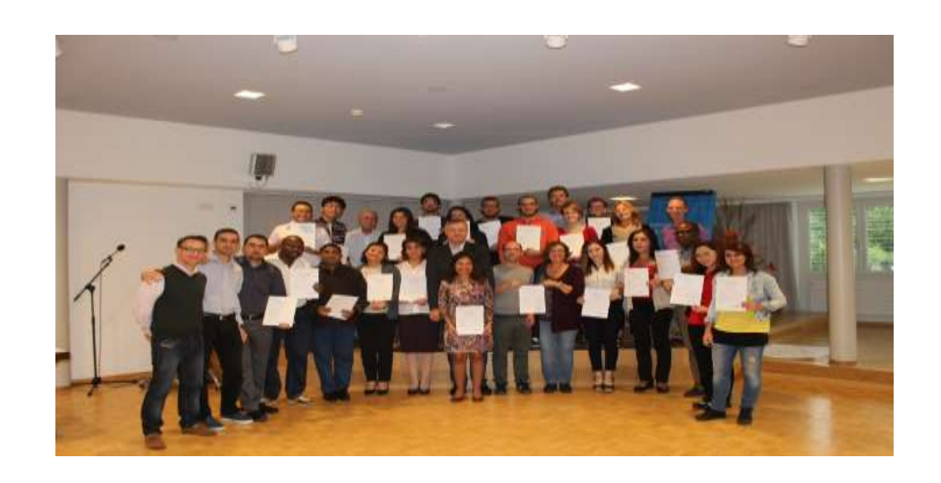
IPD Training Programs: Theory - Practice - Research - Exchange - Networking - Contribute

We bring together Academic Institutions, State, Private and Public Sectors